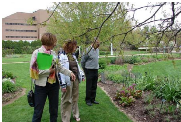
A "walk & talk" session - outdoor