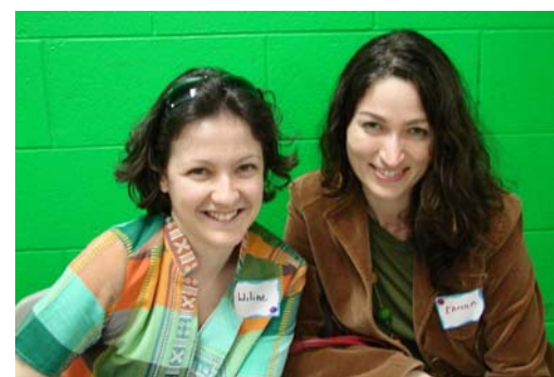
New doctors (PhDs) in the LATTICE family